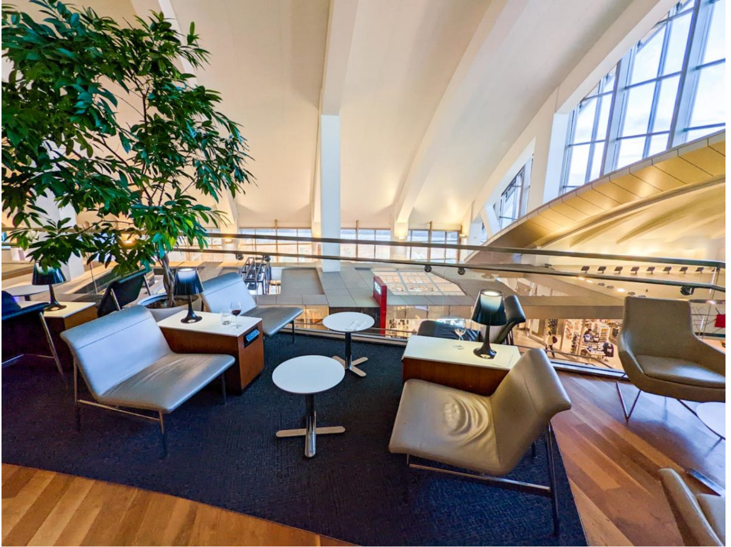
Indoor Terrace at the Star Alliance Lounge LAX.

The real joys of the space however can quickly be found on the terraces. And yes, there are two. One circular terrace wraps around the interior of the Tom Bradley Terminal. It is nothing short a wonderful space.