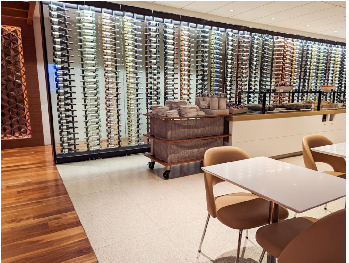
Buffet at the Star Alliance Lounge LAX.

The food menu rotates all too frequently to make sense here, but things like rice with chicken in a black bean sauce and some side salads are what you can expect.