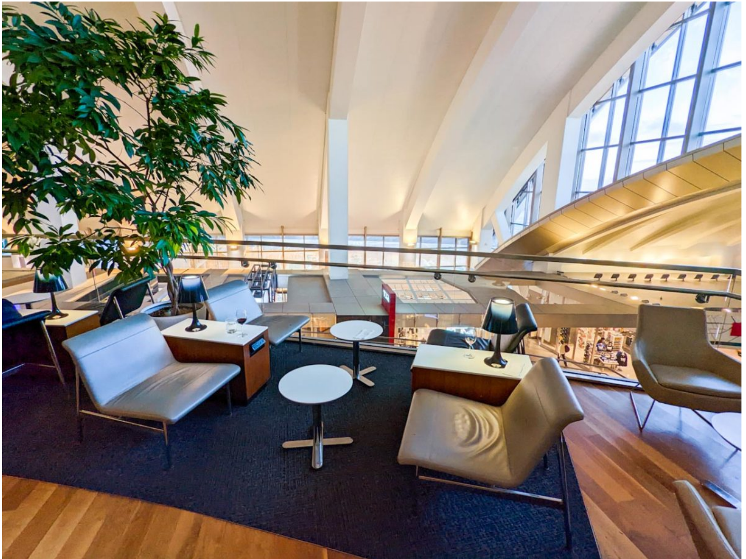
Indoor Terrace at the Star Alliance Lounge LAX.

The Star Alliance Lounge at Los Angeles International (LAX) within the Tom Bradley Terminal is very good.