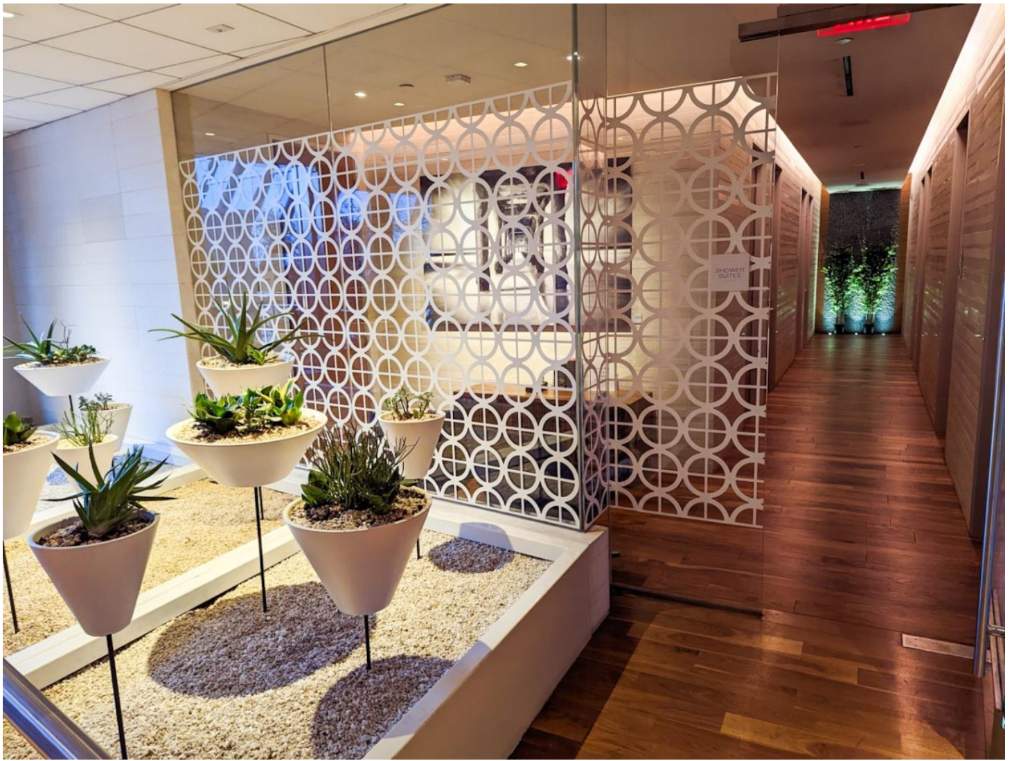
Entrance to Star Alliance Lounge shower suites.